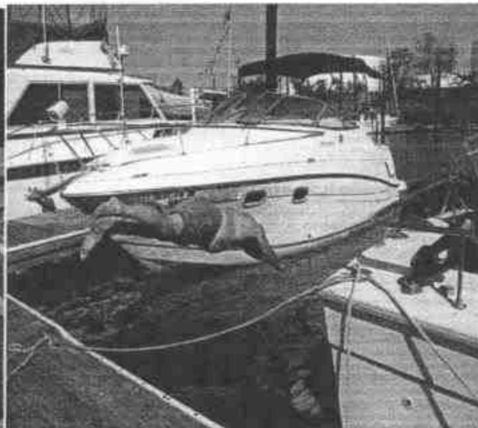
Like a Fish to Water