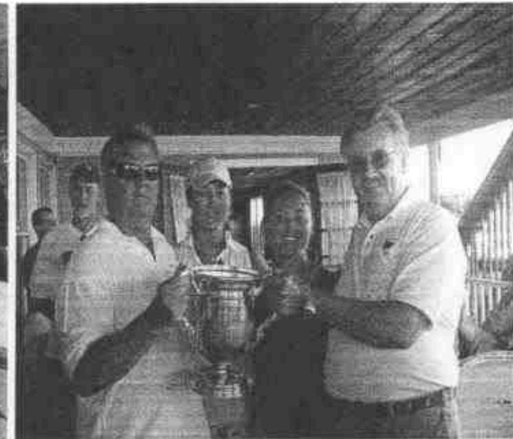
Pride in the accomplishment