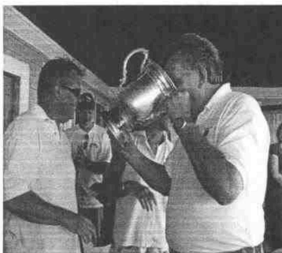
The Sweet Taste of Victory

You may remember from earlier issues, this is a "Predicted Log Contest". It's a race of skill, not speed. It is also the oldest race of its kind in New England. We have not had the CUP returned to our Club for several years now, and we have been the butt of many jokes because of it.