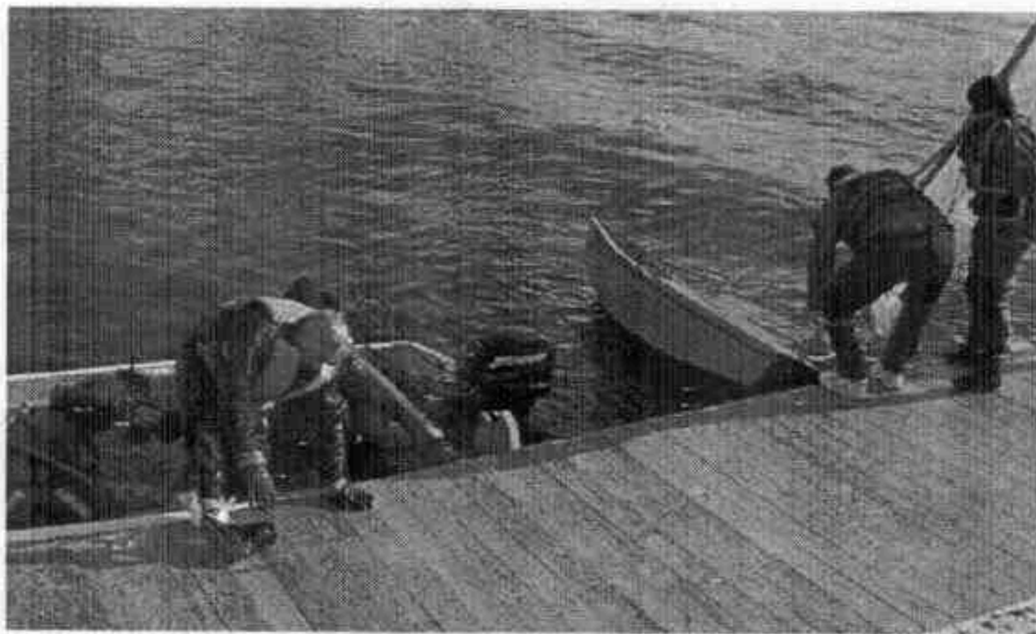
I would have took more pictures but it was too cold to even stand outside.